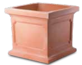
Weathered Terracotta Ref: 34