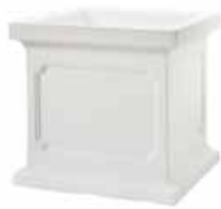
Alpine White Ref: 00