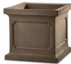
Mocha Ref: 44