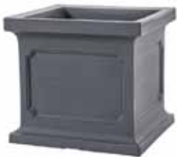
Slate Ref: 97