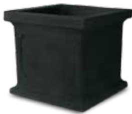
Caviar Black Ref: 94

QUICK SHIP COLORS - IN-STOCK AND READY TO SHIP